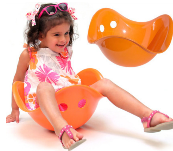
"Bilibo". Photograph. n/a. www.fatbraintoy.com . Web. 06 Nov 2013.