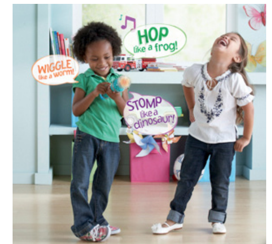
"Magic Moves Electronic Wand". Photograph. n.d. www.difflearn.com . Web. 06 Nov 2013