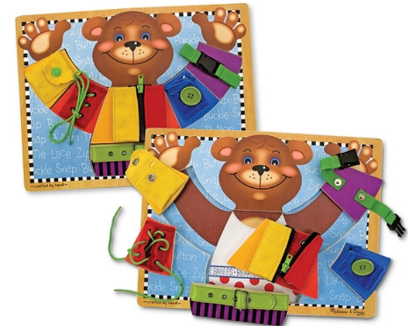
"Basic Skills Board". Photograph. n.d. www.sensorygoods.com . Web. 06 Nov. 2013.

For more information about this toy visit www.sensorygoods.com